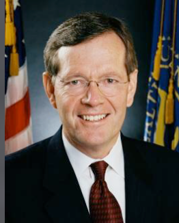
MICHAEL O. LEAVITT FORMER HHS SECRETARY AND GOVERNOR OF UTAH